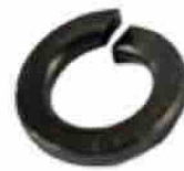
Lock washer 3/8" self-locking