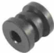
Chain tensioner roller (pa)