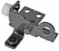
Rear axle plate set bkt

PIÈCES DE PLATEFORME - PLATTFORMERSATZTEILE