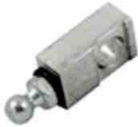
Gas spring holder/rsfront cylinder

PIÈCES DE PLATEFORME - PLATTFORMERSATZTEILE