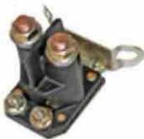
Solenoid 12 V trombeta/clamp

SOLÉNOÏDES/CONTACTEURS - MAGNETSCHALTER/SCHÜTZE