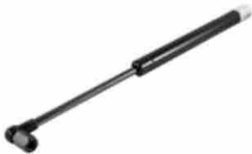
Gas spring set 14,468 ext./8,956 co