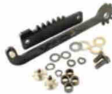
Kit for VISTA front gear holder CL955XT