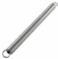
Seat top spring fold for CHAIR TOPPER