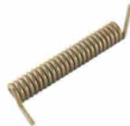
Torsion spring (ea)