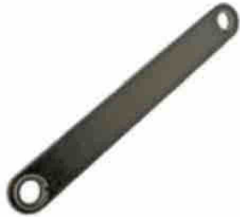
Locking device set, lever roller buffer

BUTÉES DE ROUES & ACCESSOIRES – ABROLLSICHERUNGEN & ERSATZTEILE