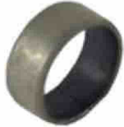
Bushing 3/4 id x 3/8l - 12DU06