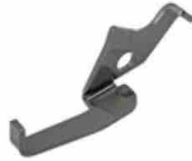
Retainer locking hook