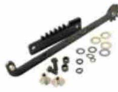
Kit for VISTA front gear holder 48"/51" flat