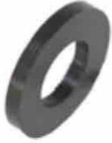
Cam pin spacer

VIS, ÉCROUS & RONDELLES - SCHRAUBEN, MUTTERN & RINGE