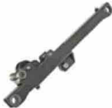
Folding arm set - 42 FTG-rear