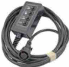
Manual control for UVL855 EVOM