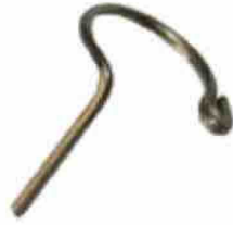
Clamp guard (gas spring)

RESSORTS & VÉRINS À GAZ - FEDERN & GASDRUCKFEDERN