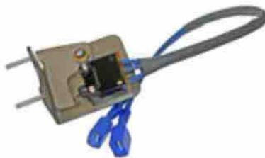
Bridge switch set/rear