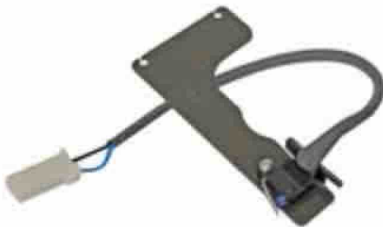
Bridge switch kit/nl/ncl-2