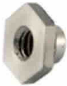
Nut 1/4" - 20 x 3/16" roller buffer