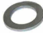
Washer M21 x 33 x 2,5 zp