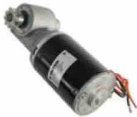
24 V drive/pinion motor assembly for UVL