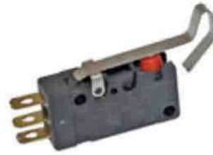
Waterproof micro switch