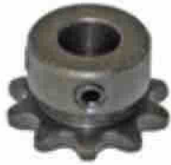
Pinion - 3510 x 1/2"

PIÈCES DE PLATEFORME - PLATTFORMERSATZTEILE