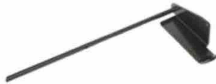
Lever for opening/locking retainer – right side