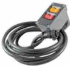
Main control for HH bkt mnt-10' qd