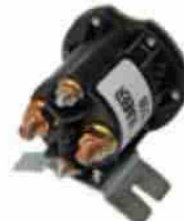
Solenoid 24 V