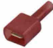
18/22-m.spd-1/4-cable lug (ea)