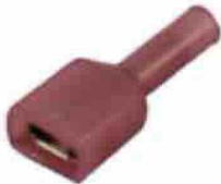
18/22-f.spd-1/4-cable lug (ea)