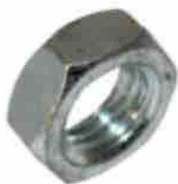
Nut-3/4" - 10 zinc plated jamb