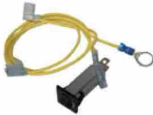
Redundant relay kit circuit

INTERRUPTEURS DE FIN DE COURSE/MICRORUPTEURS - END-/MIKROSCHALTER