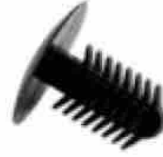
Stopper-interior-plastic tappet/ black