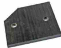
Foot roller buffer pad