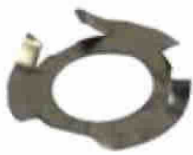
Disc spring claw washer 1,004 x 516