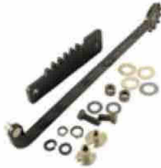
Kit for VISTA rear gear holder 48"/51" flat

PIÈCES DE PLATEFORME – PLATTFORMERSATZTEILE