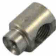
Retainer clevis fork