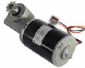
12 V drive/pinion motor assembly for UVL