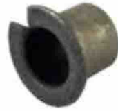
Flanged bushing 10 x 12 mm - BB10