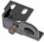
Connecting bridge rear support

PIÈCES DE PLATEFORME – PLATTFORMERSATZTEILE