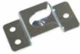
M-support clip manual control

PIÈCES DE PLATEFORME – PLATTFORMERSATZTEILE