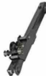
Folding arm set - 42 FTG-front