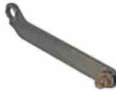
Lever set interior front barrier