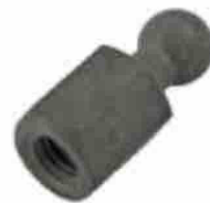
Spherical pivot - 13 mm with 3/8" female