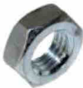
Nut 5/16" - 24 lh hex jam zp