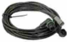
Extension cord for manual control

CÂBLES DE BATTERIE - KABEL & ERSATZTEILE