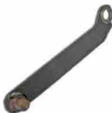
Lever set interior rear barrier