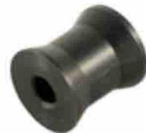
Nylon roller 21/64" x 7/8" x 1,03