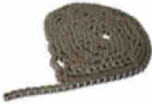
Nickel plated chain #35 roll x 137,04