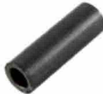
Bushing -5od x 0,334 Id x 1,515 lg