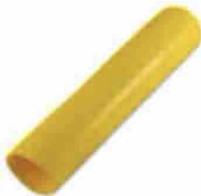
Ergonomic handle, yellow, 1,23" id x 6"