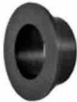
Plastic flanged bushing 3/8 id x 1/4"