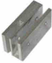
Pivot block and guardrail block

BLOCS DE DÉFILEMENT, GALETS & PLAQUES D'USURE – GLEITBLÖCKE, LAUFROLLEN & VERSCHLEISSPLATTEN