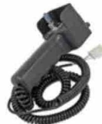
Manual control, single function VANGATER & I710 (CHAIR TOPPER)