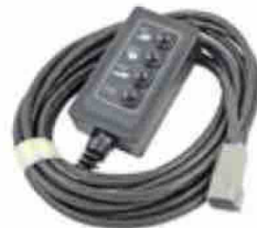
Manual control for UVL855RH/16'