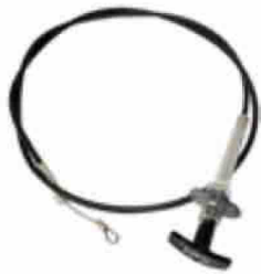
Cable kit with manual opening