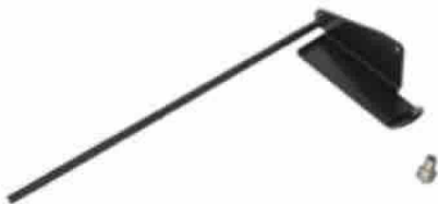
Lever for opening/locking retainer – left side