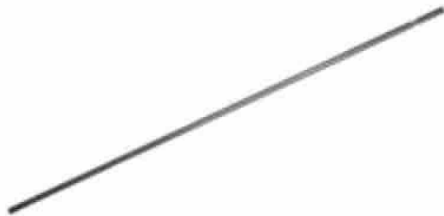
Rear barrier coupling rod