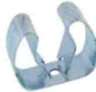
Manual pump lever attachment