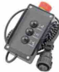
Manual control for UVL, helical cable with e-st