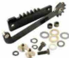
Kit for VISTA rear gear holder CL955XT