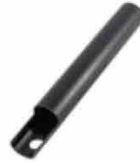
Gas spring shield (ea)