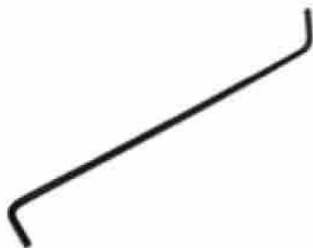
Rod 5/32" for torsion bar spring front