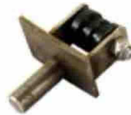
Chain tensioner WMT - for UVL855EVO