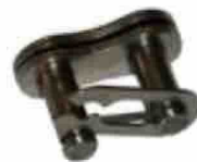
Connector #35 chain np