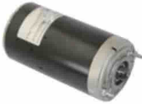
Monarch motor pump 12 V-low TPM