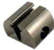
Lifting clamp lock