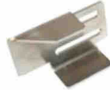
Cam lock device actuator/evom