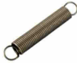
Spring 1/2" x 3 x 055 ext l 6"