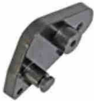
Locking device WMT crank