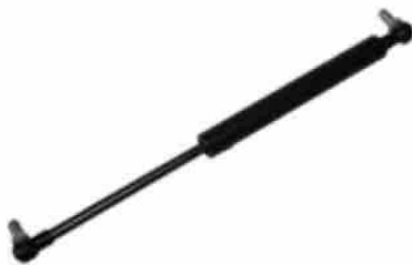
Gas spring set