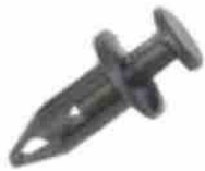
Push rivet in 8 mm