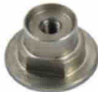
Retainer lever pin