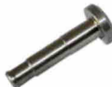
Platform front pin/CL955