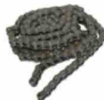
Chain extension kit-l700x