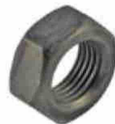
Nut 1/2" - 20 hex jam/ self-locking