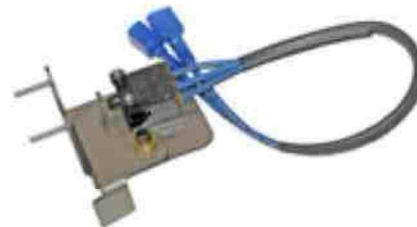
Bridge switch set/front