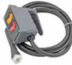
Main control for HH bkt mnt 8 1/3" with 6