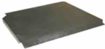
Connecting bridge (31")