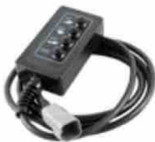
Manual control for UVL, 4 functions