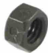
Nut 3/8" - 16 unc hex lock/ self-locking