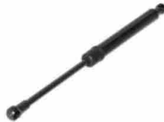
Gas spring - 14,47 ext/9,02 com-p1=1150n