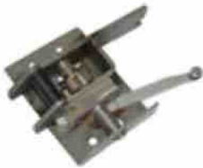
Trolley unlocking set