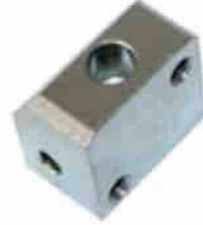
Sliding block controlling the rotation of the connecting bridge.