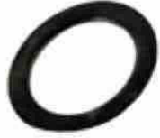
Washer 516id x 0,75 od x 0,0250 self-locking

VIS, ÉCROUS &amp; RONDELLES - SCHRAUBEN, MUTTERN &amp; RINGE