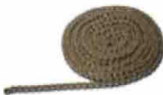
Nickel plated chain #35 roll x 142,92"