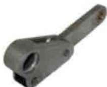
Lever set for controlling the rotation of the connecting bridge/for UVL