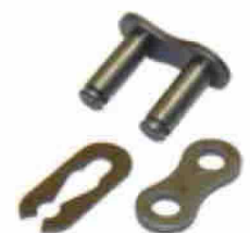
Chain connection #35