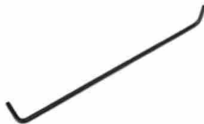
Rod 5/32" for torsion bar spring rear