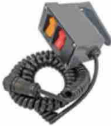
Main control for VISTA

BOÎTIERS DE CONTRÔLE & ACCESSOIRES – BEDIENKÄSTEN & ERSATZTEILE