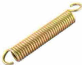
Ramp assist spring, alt