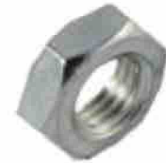
Nut 5/16" - 24 hex jam zp