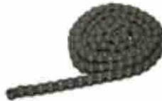
Chain #35 (seat top) -45"