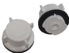
REF 168TA1649 Old: BAT/48839