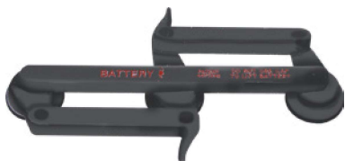
REF 115TA6845 – Quick release for 6 V batteries with 3 plugs Old: BAT/21157 REF 168TA1077 – Quick release for 8 V batteries with 4 plugs Old: BAT/21158