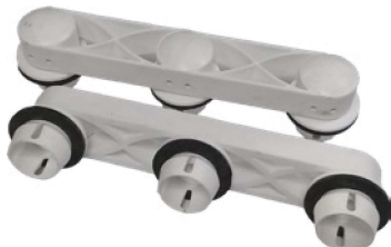
REF 168TA1648 Old: BAT/48840