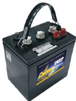
REF 115TA6846 Old: BAT/20016